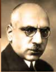
Yahya Khan Gharagozlu Etamad al-Dole , Minister of Education

A general plan to establish Dar ol-Olum in Tehran was devised and presented.